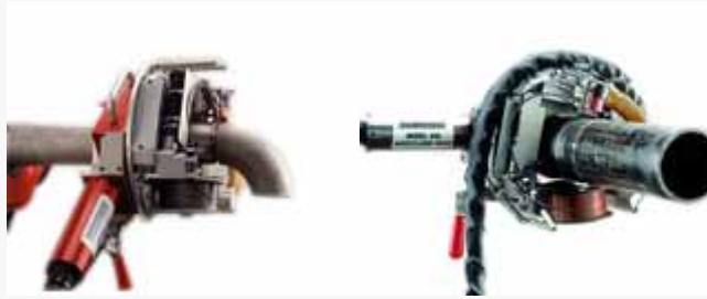
Piping All-position Automatic Welding Machine(GTAW)